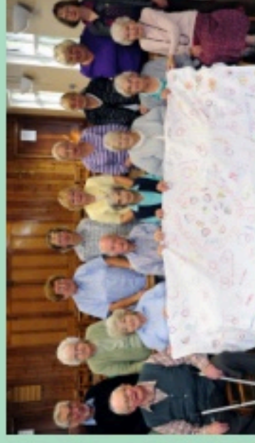
Summersdale Afternoon Club received a Cragwood Fund Grant in 2015.

Links to Comic Relief Local Communities online and downloadable application forms and criteria are available on our website. The deadline for applications to Round 1 16/17 is Friday 15th April, 5pm.