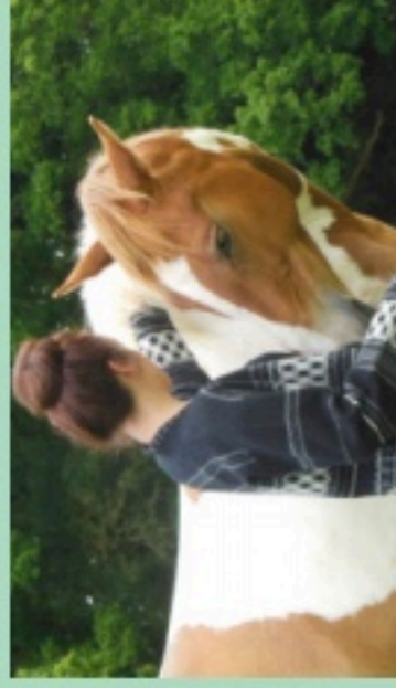
Equine Partners CIC received an Open Door Fund grant in 2015.